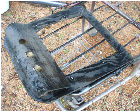
I painted the finished wood to help preserve it.