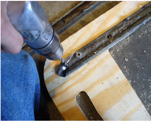
Use the rails to guide the drill.