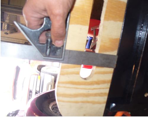
Getting the exact measurements is essential