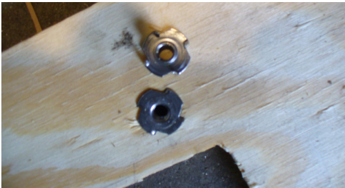
Captive nuts are inserted