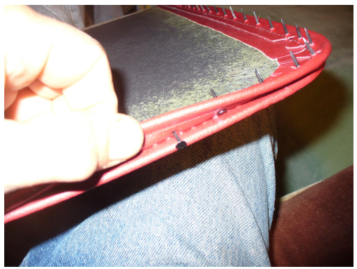
a tack every ¾ in is required to hold it secure.