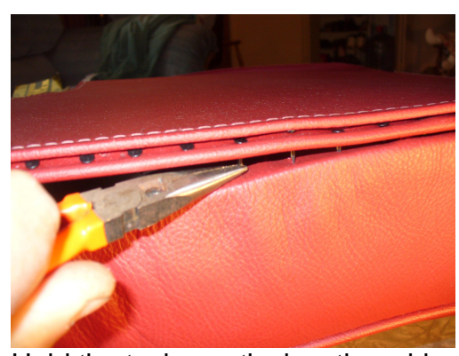
Hold the tacks vertical so they drive home straight.