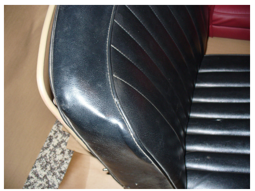
A second view