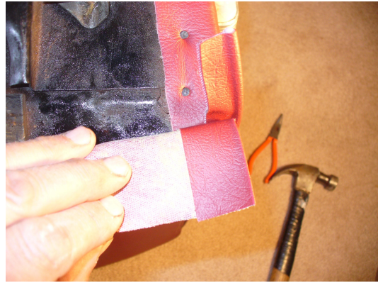
Final fit and gluing on the bottom to keep things tidy