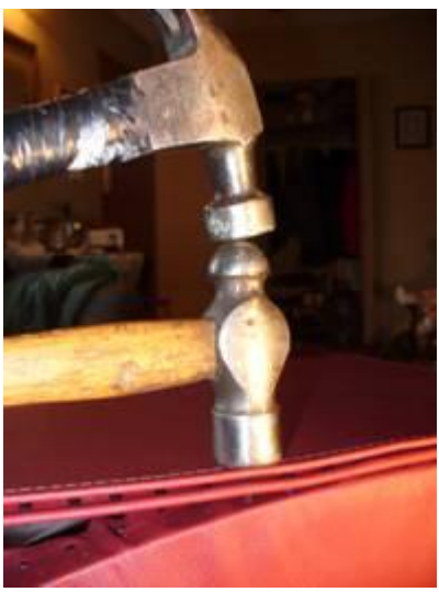
One hammer hold it down and the other provides the force.