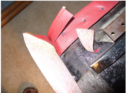
Note triangular piece cut from edge to make it fit.